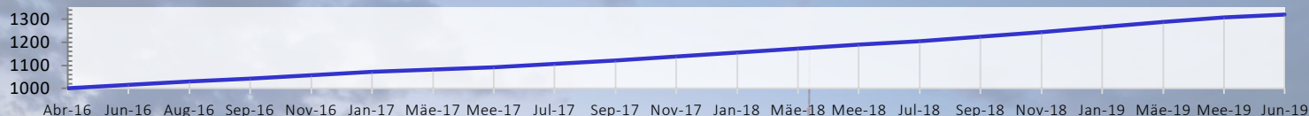
Share Class E - EUR

The Marshall Bridging Fund (MBF) offers investors access to secure and predictable returns from short term financing of property projects in major European cities, focusing on Germany. The fund's returns are not dependent on the rise in value of any property and thus is unaffected by any volatility that may occur short term in the property values.