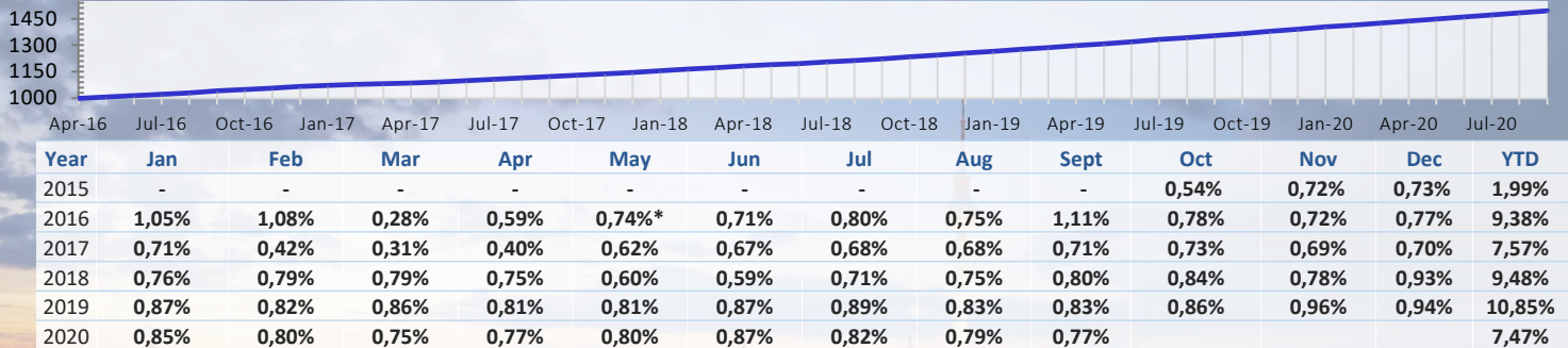
Share Class E - EUR

*Oct 2015-Apr 2016 Class A. Performance from May 2016 Class E