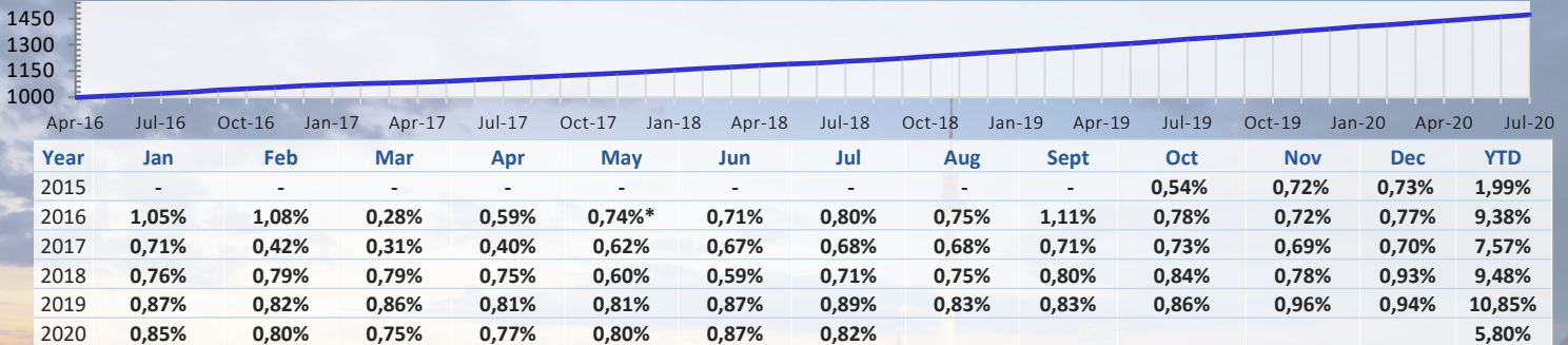
Share Class E - EUR

*Oct 2015-Apr 2016 Class A. Performance from May 2016 Class E