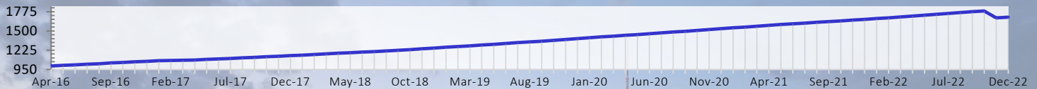
Share Class E - EUR

The Marshall Bridging Fund (MBF) offers investors access to secure and predictable returns from short term financing of property projects in major European cities, focusing on Germany. The fund's returns are not dependent on the rise in value of any property and thus is unaffected by any volatility that may occur short term in the property values.