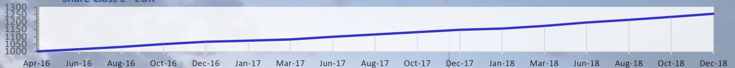
Share Class E - EUR

The Marshall Bridging Fund (MBF) offers investors access to secure and predictable returns from short term financing of property projects in major European cities, focusing on Germany. The fund's returns are not dependent on the rise in value of any property and thus is unaffected by any volatility that may occur short term in the property values.