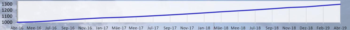
Share Class E - EUR

The Marshall Bridging Fund (MBF) offers investors access to secure and predictable returns from short term financing of property projects in major European cities, focusing on Germany. The fund's returns are not dependent on the rise in value of any property and thus is unaffected by any volatility that may occur short term in the property values.