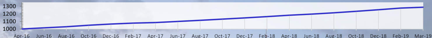
Share Class E - EUR

The Marshall Bridging Fund (MBF) offers investors access to secure and predictable returns from short term financing of property projects in major European cities, focusing on Germany. The fund's returns are not dependent on the rise in value of any property and thus is unaffected by any volatility that may occur short term in the property values.