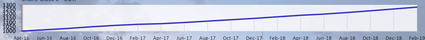
Share Class E - EUR

The Marshall Bridging Fund (MBF) offers investors access to secure and predictable returns from short term financing of property projects in major European cities, focusing on Germany. The fund's returns are not dependent on the rise in value of any property and thus is unaffected by any volatility that may occur short term in the property values.